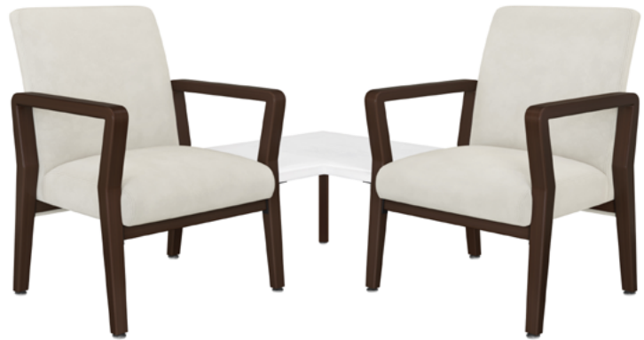
Model: CRLKTLBLC (Also displayed with two CRGE. Not included.) 29W 29D 15H

Kwalu Linking Tables add a level of functionality placed inline and in corners between guest and bariatric seating models. Choose square, rectangle and wedge-shaped tables for visitors to place devices and other items in healthcare wait spaces. The Carrara Corner Linking Table is available in a straight or curved style and is equipped with a center leg support. Carrara Linking Tables also include Center and Wedge models.